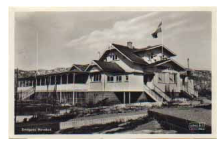
Smögens havsbad in the early days

guests where mudbaths and a lot of similar health-promoting treatments were served to the guests. Smögens Havsbad became rapidly very popular, attracting guests from all parts of Sweden and from abroad. One proud moment was when Smögens Havsbad was visited by King Gustavus VI Adolphus in 1955. During the 70ties and 80ties the building suffered from disrepair and the situation became desperate during the early 90ties.